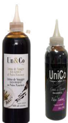
Cream of Pedro Ximénez Balsamic Vinegar Un&Co 250 ml/400 ml