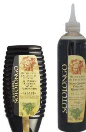
Pedro Ximénez Balsamic Vinegar Reduction Sotolongo 250 ml/400 ml