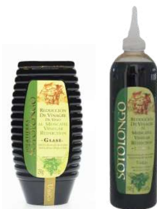
Moscatel Balsamic Vinegar Reduction Sotolongo 250 ml/400 ml