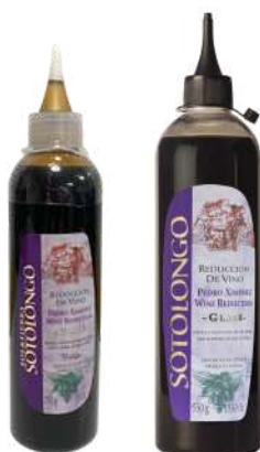
Pedro Ximénez Wine Reduction Sotolongo 250 ml/400 ml