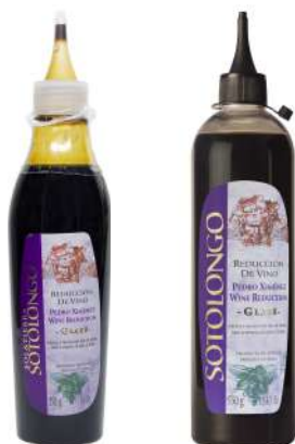
Pedro Ximénez Wine Reduction 250 ml/400 ml