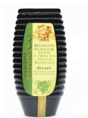
Moscatel Balsamic Vinegar Reduction 250 ml/400 ml