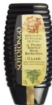
PX Balsamic Vinegar Reduction 250 ml/400 ml